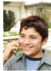
talking on the phone