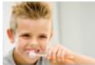
brush my teeth