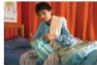
go to bed