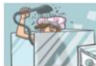
have a shower